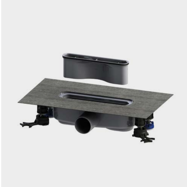
FLOWDRAIN HORIZONTAL REGULAR