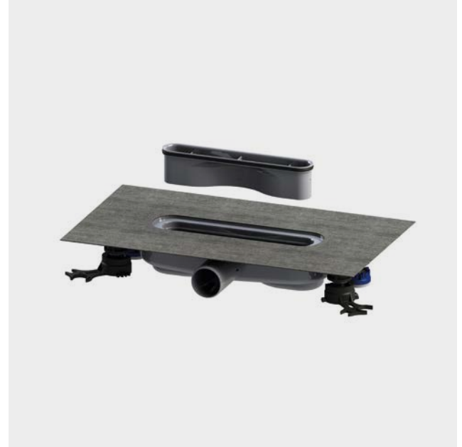
FLOWDRAIN HORIZONTAL FLAT